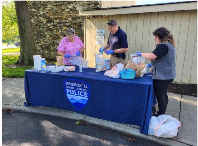
May 24th Drug Take Back Event