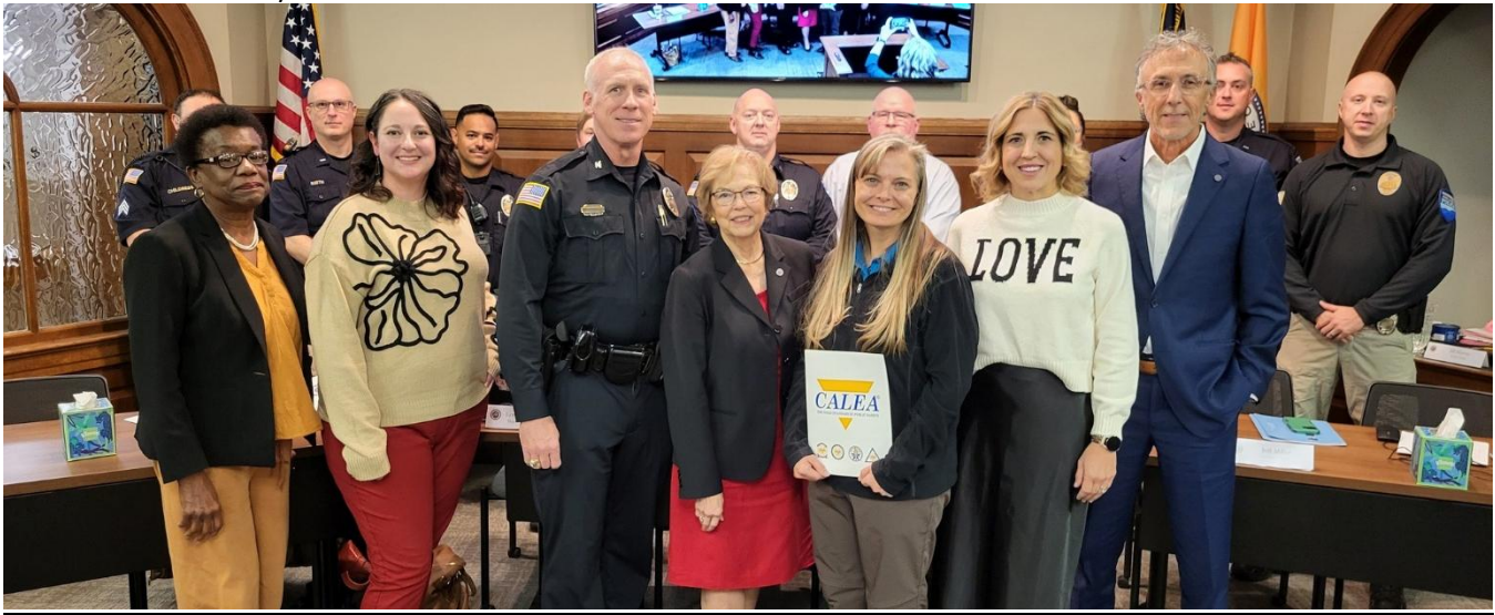
City Council Recognized HPD on their CALEA Accreditation on December 5, 2024