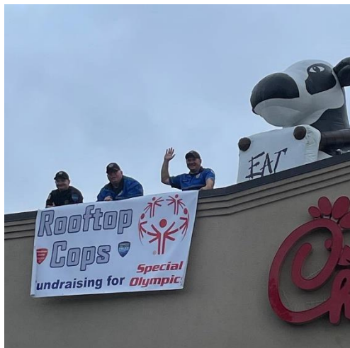
Officers on the roof of Chick-fil-A