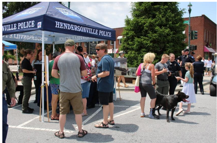
HPD Booth at the 175th Anniversary Celebration