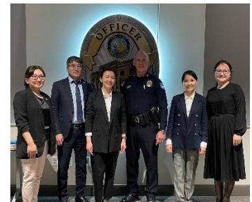
Mongolian prosecutor visit