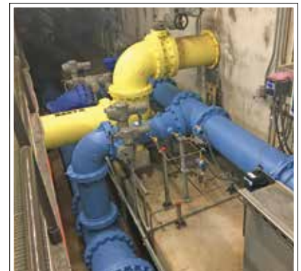
Filter Pipe Gallery

The WTF is fully automated and utilizes a SCADA system to monitor the plant, water storage tanks, pump stations and distribution system. The SCADA system consists of Rockwell “Factory Talk” human machine interface (HMI) software and a communication network that incorporates Allen-Bradley programmable logic controllers (PLCs). The remote sites are monitored and controlled via radio.