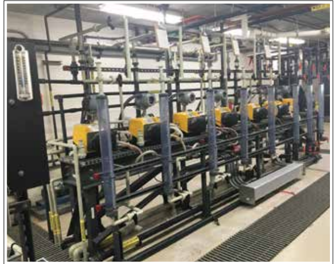
Chemical Feed Pumps