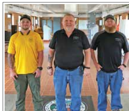
Staff, 2nd Shift, August 2019