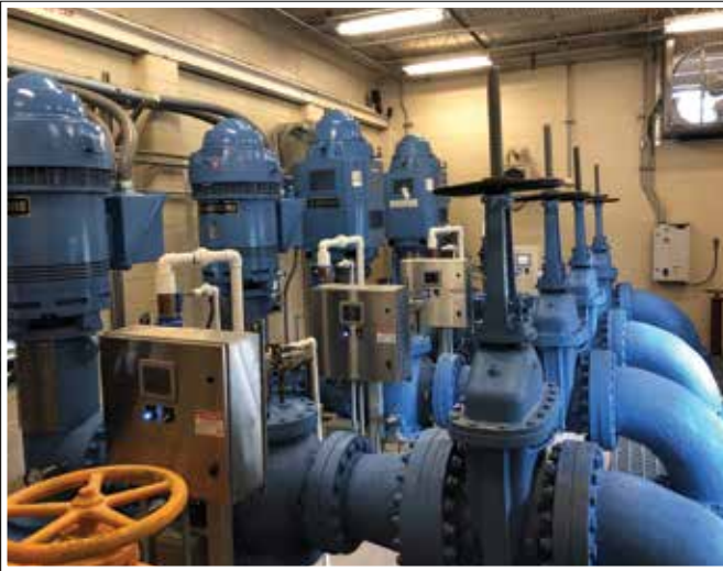
New Finished Water Pumps