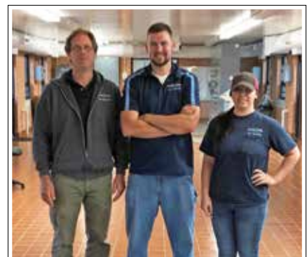
Staff, 3rd Shift, August 2019